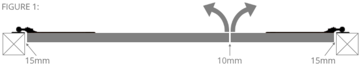
FIGURE 1: (most popular set up). Gates to open towards driveway. Hinge plates mounted to rear face of post/ pillar. Back edge of gate sits flush with the back edge of post/ pillar.